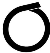
LEFT HAND WOUND