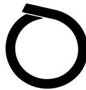
RIGHT HAND WOUND

Refer to SpringPro or ruler-style Spring Wire Gauge to measure wire or measure 20 coils of wire and convert to wire size using chart below. Confirm by color code if available